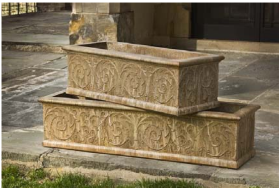
P-566 and P-567 in the NEW Aged Limestone (AL)

Aged Limestone has changed from our original interpretation of this color. Many factors are involved in creating an original hand applied patina which affect the end result. Due to pigment variations and customer requests our Aged Limestone has changed from the look above to the look below. It is a softer blend of colors, and more like natural aging.