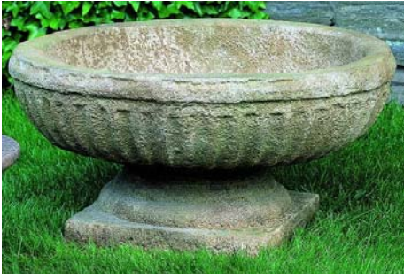
2930 on 2932 in the OLD Aged Limestone (AL)