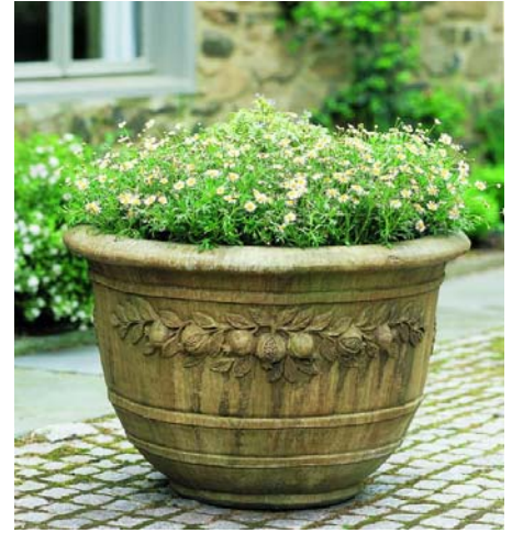
P-209 in OLD Aged Limestone (AL)

Aged Limestone has changed from our original interpretation of this color. Many factors are involved in creating an original hand applied patina which affect the end result. Due to pigment variations and customer requests our Aged Limestone has changed from the look above to the look below. It is a softer blend of colors, and more like natural aging.