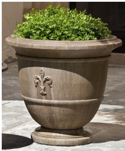
P-573 in NEW Aged Limestone (AL)