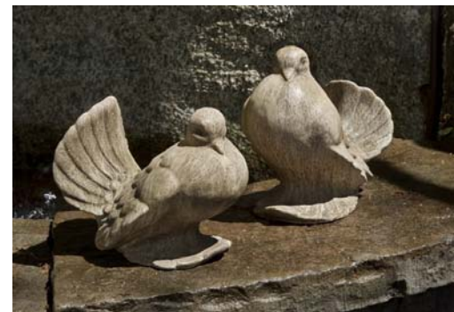
A-037 and A-038 NEW Aged Limestone (AL)